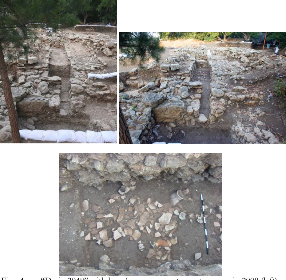
Figs. 4a-c. "Drain 2048" with long/narrow space to west, as seen in 2008 (left); same view after excavation in 2009 (right); pottery in situ (below)

Excavations during 2009 (Fig. 4b) revealed that below the white plaster floor (L. 2135, 2175) and its stone makeup (L. 2177, 2193), the area was filled with two distinct fills, each containing much restorable pottery still in situ.