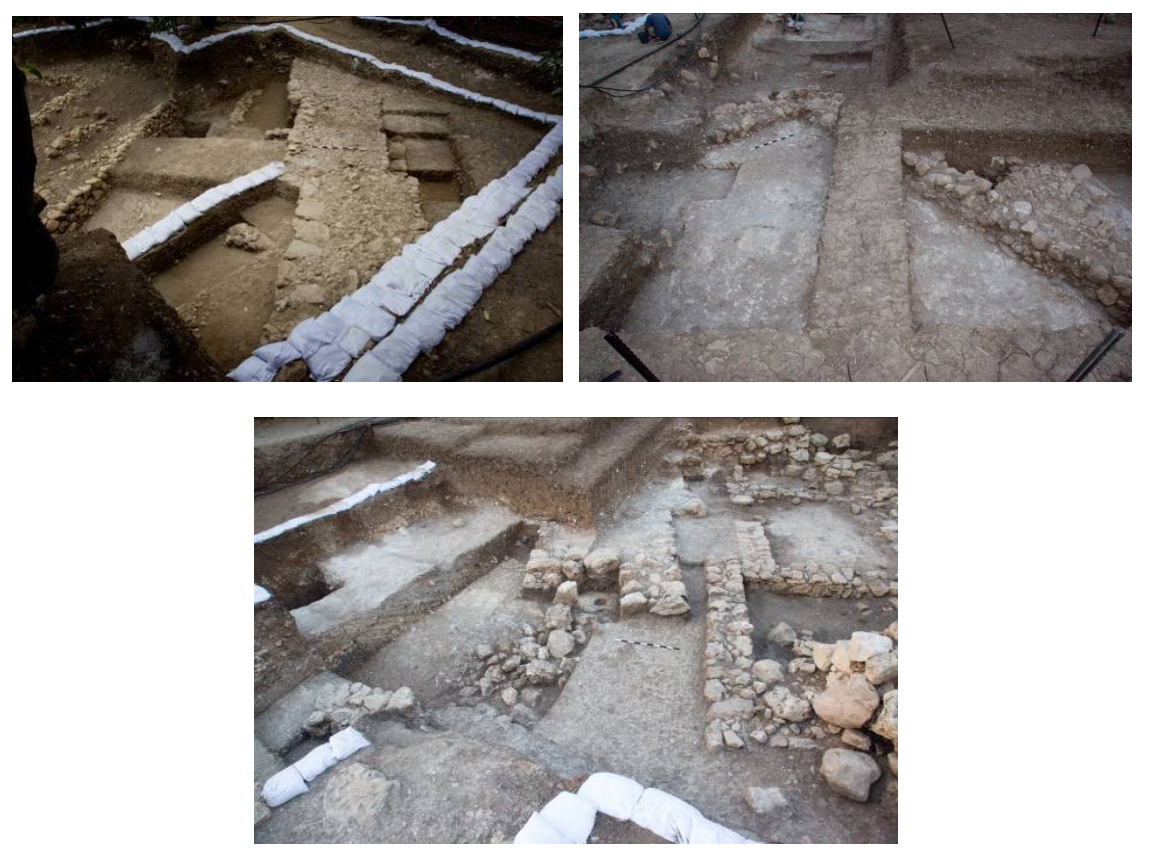
Figs. 2a-c. Principal areas of excavation in 2009: D-West (top left), D-South (top right), and F (bottom)

We are pleased to report that the 2009 season of excavations at Tel Kabri met with a great deal of success. We were able to successfully identify the northern external wall of the palace and to excavate a drain/corridor area full of pottery in Area D-West as well as to link our excavations in Area D-South with those of Kempinski and Niemeier in Area F while at the same time exposing new architectural features belonging to the southeastern wing of the palace in this area (Figs. 2a-c). In both D-West and D-South we found numerous fragments of plaster, including painted fragments coming from at least one additional wall fresco and one additional floor, all painted using Aegean-style techniques. Some of these have pictorial representations in white or red in front of a blue background, which have parallels to contemporary compositions found on Crete (as well as to later compositions on Mainland Greece). Tel Kabri therefore probably has both Cycladic and Minoan painted walls and floors, including the first identifiable Minoan frescoes to be found in Israel. The discovery of these fragments within specific contexts also helps to further refine the chronology and history of the palace and the overall site.