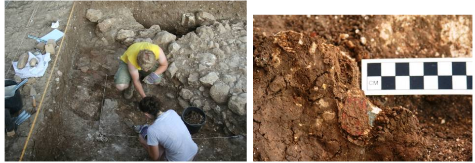
Figs. 7a-b. Excavation of painted wall plaster in Area DS-1 (left); small fragment with red and blue paint still in situ (right)

Square 6, however, was extremely interesting. Not only did Wall 3017 continue diagonally SW-NE across the entire square, but a second wall (3027) connected with it and headed almost straight north near the eastern edge of the square, with a return running southwest to create a small chamber (3033), while a third wall (3031) connected with it and headed almost straight south near the western edge of the square (Fig. 6a). Moreover, as Wall 3017 disappears into the western baulk, a threshold can be seen – no doubt an entrance into a room lying to the southeast which remains to be excavated. Thus, in addition to the southern room with a crushed lime floor created by Wall 3017 in Square 6 and Wall 3043 in Square 5, there are at least two partially-exposed rooms, or perhaps one small room and a courtyard, lying to the north of Wall 3017 in Square 6 and another room presumably lying to the southeast of the entire square.