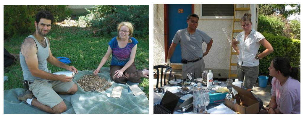
Figs. 10a-b. Wet-sieving for zooarchaeological remains (left) and sampling for residue analysis (right)

The sampling of zooarchaeological remains was carried out by Yehonatan Goldman of the University of Haifa. Samples for wet sieving (Fig. 10a) were taken from accumulations above each surface, using a fine grid system to allow for the documentation of the exact location and volume of each sample.