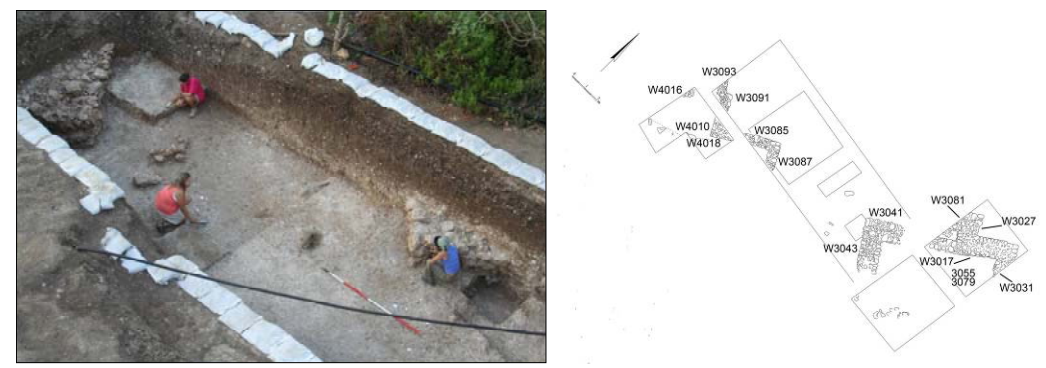
Figs. 5a-b. Area D-South as seen from the north in 2005 (left); plan of new walls uncovered in 2009 (right)

In order to achieve these goals, we opened Area D-South 2 (abbreviated as DS-2) in an unexplored space lying between the original Area D-South (to the north) and Area F (to the south), with the three areas separated only by baulks. This new area was divided into several squares, numbered from 1 to 4 running from east to west across the area. The impetus for excavating this area was to link our excavations with those of Kempinski and Niemeier as well as to determine the nature of the massive stone structure (L. 16008) uncovered running into the southern baulk of Area D-South in 2005.