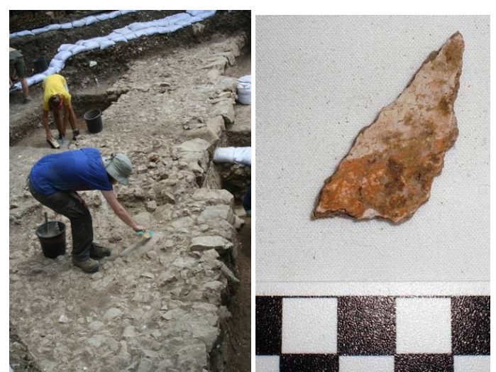
Figs. 3a-b. Wall/Road 2129 being excavated (left) and a fragment of painted wall plaster (right) in Area D-West

At this point, therefore, we would like to suggest two possible options/interpretations. Either 2129 was a foundation for a perimeter wall encircling the palace or it was the foundation for a road or a walkway adjacent to the palace. If it is a wall, parallels can be found, for example, at Megiddo in the MB fortification wall of stratum XII and the external wall of the Stratum IX LB I palace. If it is a road or walkway, parallels will have to be sought elsewhere, including in the Minoan palaces on Crete.