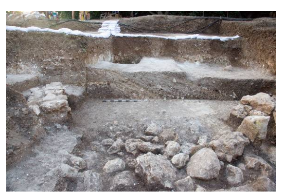
Fig. 9. Mudbrick collapse visible in Area F

The understanding of the later, MB II, phases was much more difficult because of a very large Iron Age II pit (L. 1521) which penetrated both MB I and MB II levels. However, a key discovery for understanding the MB II architecture in the area is that the two installations composed of orthostats built on top of a rubble core (L. 1517, 1538) were found to be connected by the foundation of a wall running NW-SE (3110), and are thus possibly part of a single monumental structure. Floor 1550 abuts and slopes against the face of this foundation from the west. Wall 1525, running parallel to 3110, may belong to the same period. In the east, L. 1517 was found by Kempinski and Niemeier in a corner formed by the monumental walls 1559 and 1510. New details for the plan of this large hall were discovered this year, when -- in the west -- orthostat installation1538 was found to be laid against the newly discovered NW-SE monumental wall 3108. So far the only entrance to this large room was from the north-west, west of Wall 1559.