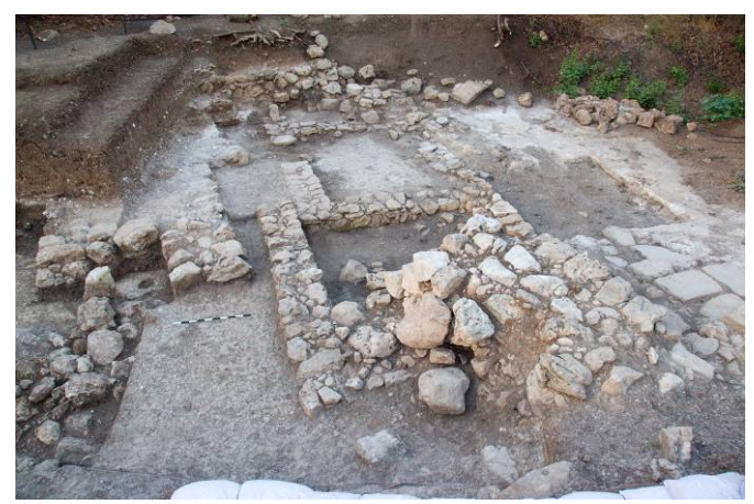
Fig. 8. Final day photograph of Area F

The excavations of Kempinski and Niemeier in the eastern part of the palace, named by them Area F, uncovered two major building phases. The MB I phase 4, with its neatly-built walls and plaster floor did not have the monumental character of the later palace, yet still possessed what seemed to be a well-planned structure (rooms 1569, 1586, 1705), more carefully built than the contemporary domestic structures in Area C. Kempinski therefore considered it to be part of a large pre-palatial structure. The nature of this structure, exposed again by us in the 2009 season, differed from the earliest, monumental MB I phases of the palace excavated by our team in Area DWE in the 2008 season.